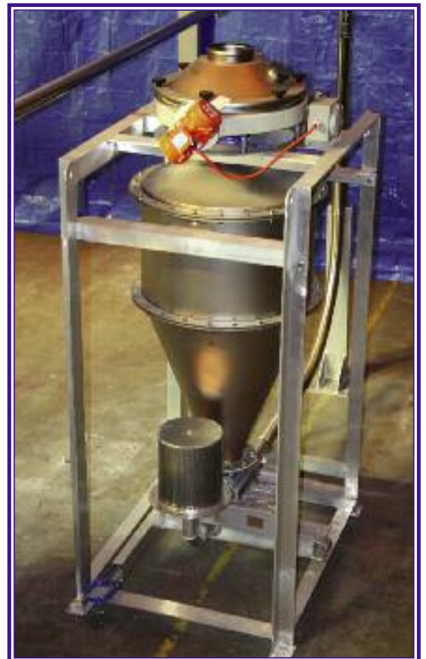
Under silo arrangement including sieve and load cell mounted weigh hopper