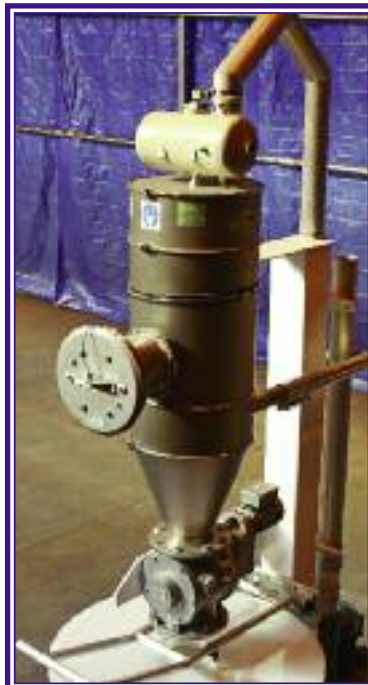
Typical footprint for internal receiving vessel and seal plate